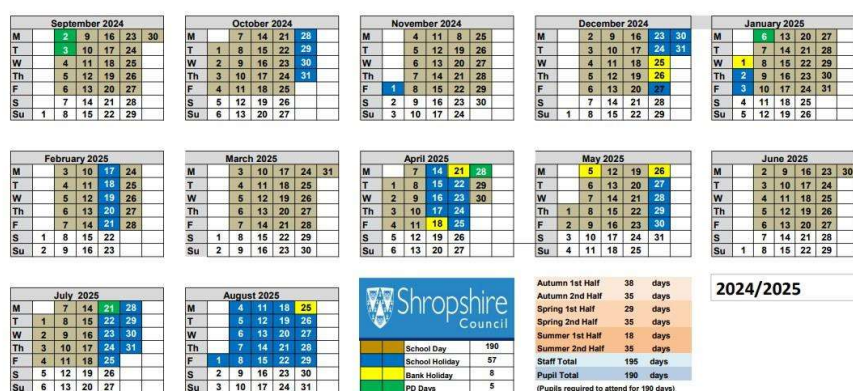
Longden CE Primary School and Nursery - School Terms and Holiday Programme 2024/25

https://www.longden.shropshire.sch.uk/term-dates-and-school-opening-hours/