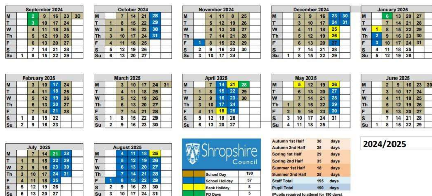
Longden CE Primary School and Nursery - School Terms and Holiday Programme 2024/25

https://www.longden.shropshire.sch.uk/term-dates-and-school-opening-hours/